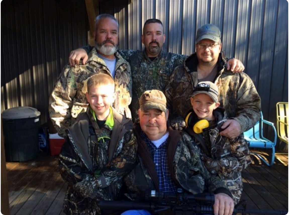
PaPa and the boys at the farm 2013